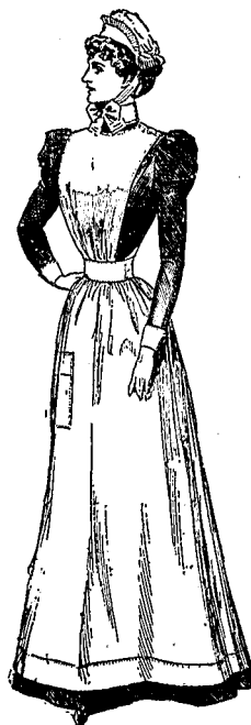
The "Rena" Apron. Made of linen finished Cloth lock-stitch throughout, 2/6 each. In two sizes, 36 in. & 39 in. from waist to hem.

PATTERNS FREE OF THE New Washing Materials for Nurses' Dresses, INCLUDING REGATTA CLOTHS, HECTOR DRILLS, HALIFAX CLOTH, ATTALEA TWILLS, &c.