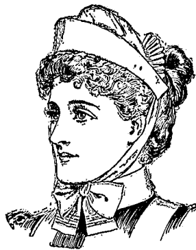
The New "Sister Dora" Cap. Made of washing Cambric, with draw strings. Can be washed as easily as a handkerchief. 1/-. Without strings, 10½d.