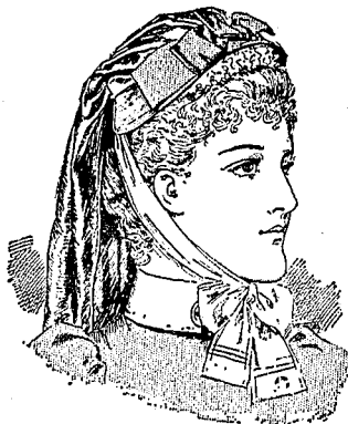
The "St. Bride's" Bonnet. Made of fine Straw with Lace and ruching, and trimmed with Ribbon, and long Silk Gossamer Fall. In black and colours, 12/6 each. Without Fall, 9/6; also The "St. Clare" Bonnet. 6/11 complete.